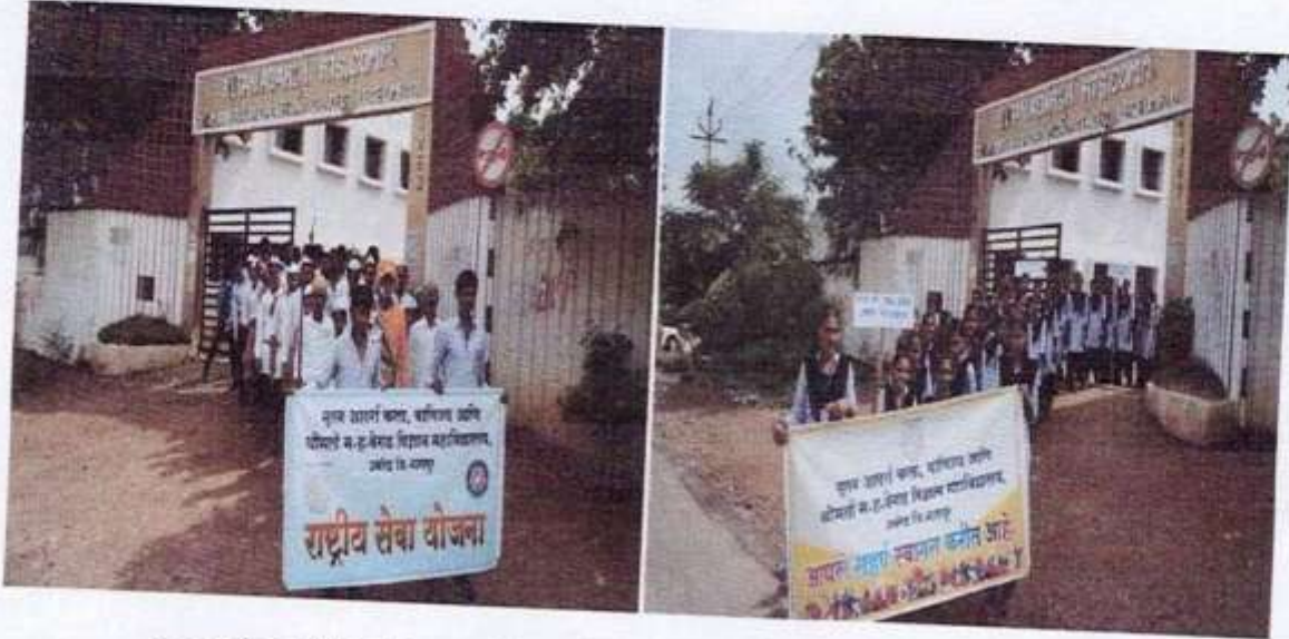
स्वच्छतेचा संदेश देण्यासाठी महाविद्यालयातून प्रस्थान करतांना विद्यार्थी