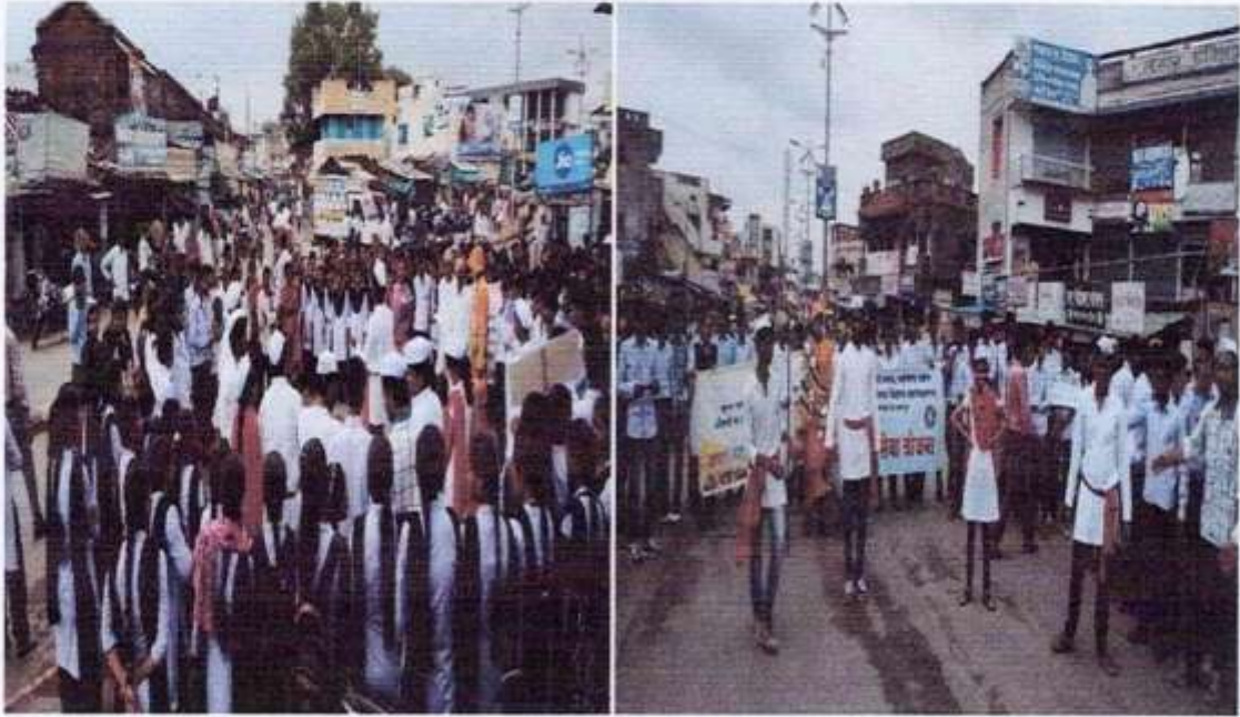
उमरेड शहरात पथ-नाट्य द्वारे स्वच्छतेचा संदेश देतांना विद्यार्थी