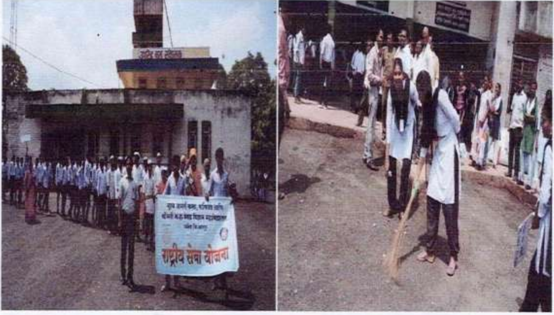
बस-स्थानकावर स्वच्छता करतांना विद्यार्थी